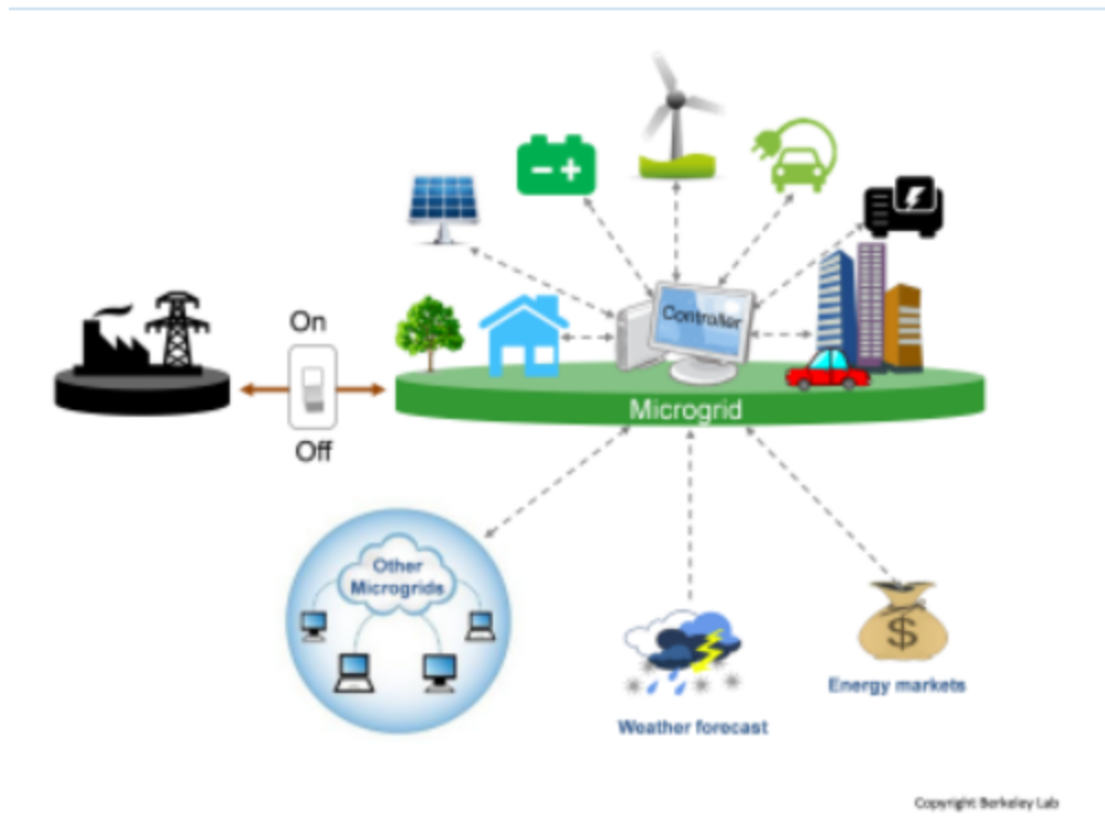
Figure 2: High-Level Microgrid Schematic