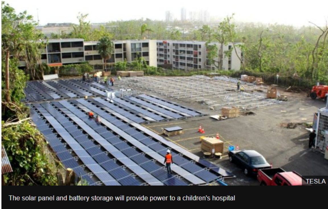
Figure 1: Solar Panels implemented in Hospital del Nino, San Juan